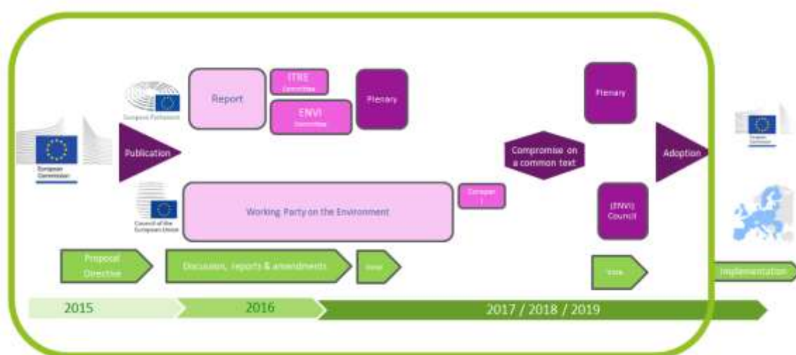
Fig.1: Status and action on EU Waste Proposal

In September 2018 Eunomia was contracted for ‘Study to support the Implementation of Reporting Obligations Resulting from the New Waste Legislation Adopted in 2018’.